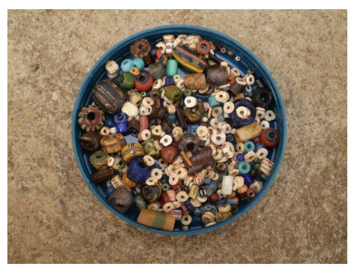
Figure 2: Assorted beads from Kromantse Burials.

The ethnographic study observed 71 family, individual and community shrines and 58 grinding stones distributed all over the settlement. The shrines appear to have been in use since colonial times and still bear colonial names associated with them according to the local traditions. The majority of the grinding stones located in the open outside the houses, is no more in use. In the next project, these will be mapped and placed in categories such as type of material, size, wear pattern the grinding surface, to determine whether they were used solely for grinding food stuff or as part of the iron working or some other process. The type and source of stones and how they may have been brought to the area will also be of interest and could help identify some of the trade connections.