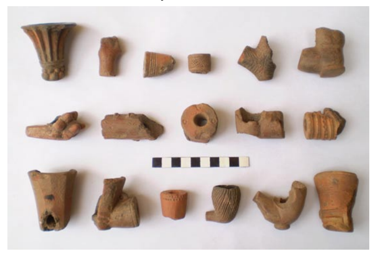
Figure 3: Assorted local smoking pipes.

our interpretation of the populations interacting in Kormantse and their connection(s). However, it is obvious from the preliminary study that much evidence awaits the archaeologist at Kormantse that will become most significant for our interpretation of the encounter of cultures during the colonial era in Africa and the African Diaspora.