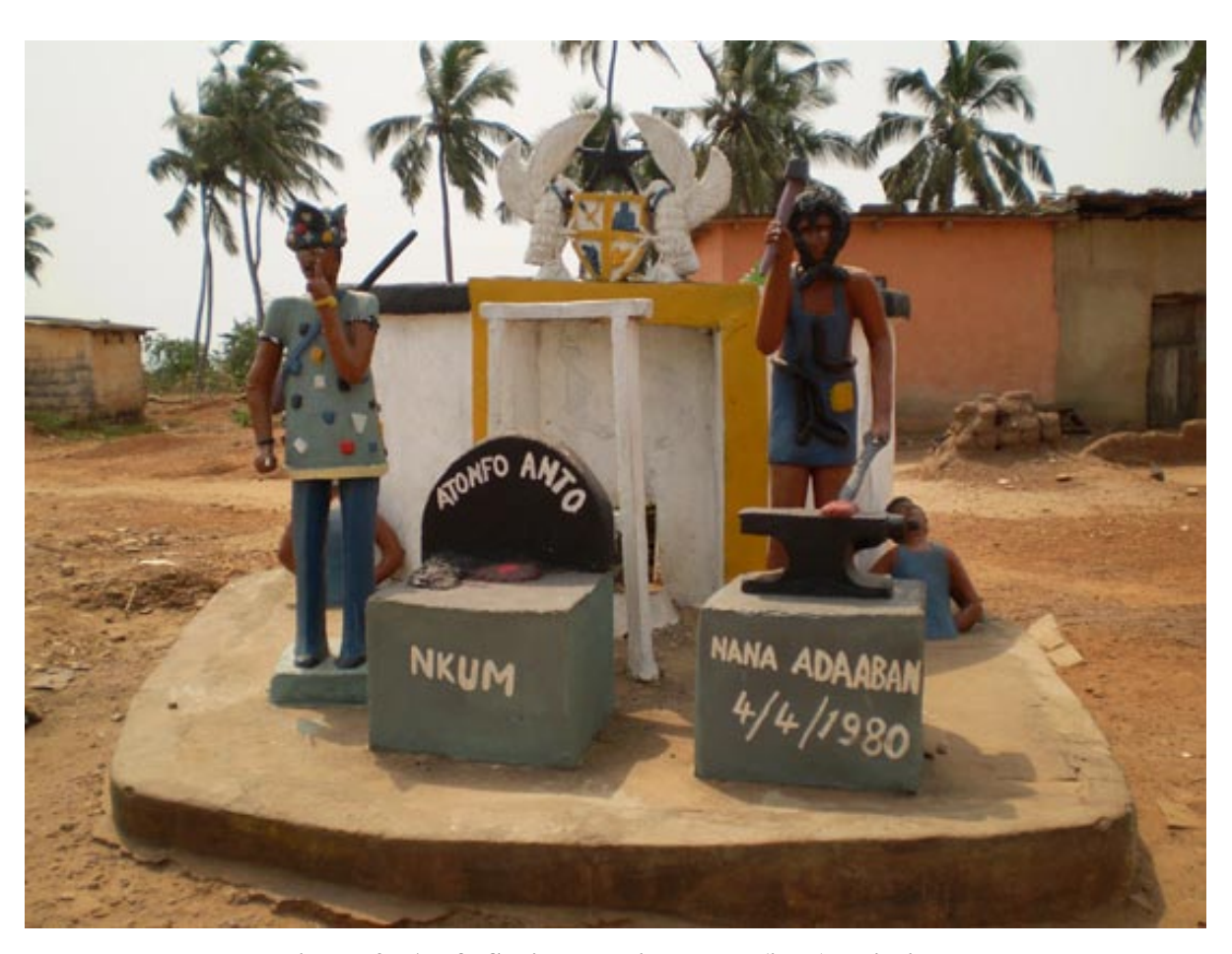
Figure 4: Asafo Shrine showing metal (iron) smithing.

The preliminary reconnaissance and survey clearly indicated the prevalence of piles of iron ore and slag all over the settlement mainly located in the corner of houses and considered s shrines, while bigger piles are located outside the settlement and within two kilometers of the outskirts. Although there is a figure of an ironsmith as part of one of the community shrine sculptures (Fig. 4), the inhabitants of the settlement insisted that there has never been an iron working industry in the settlement and that there was no such a link in the past. This suggests that if there were such an industry at all, its existence did not come down into the memories of the current or the immediately preceding generation of inhabitants at Kormantse. Who were the iron workers? How did several piles come to the area? What are the artifact associations? The piles definitely suggest antiquity of the tradition in the area. It is also possible that such an industry existed to support the European colonial trade or for manufacturing chains and other objects used in the maintaining the colonial vessels. Fragments of burnt clay objects, yet to be identified, recovered from disturbed area to the