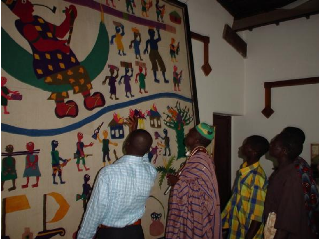
Figure 11. HRH of Tori-Bossito, Kinidégbé Gbezèkpa Gbènan at the opening of the exhibit.