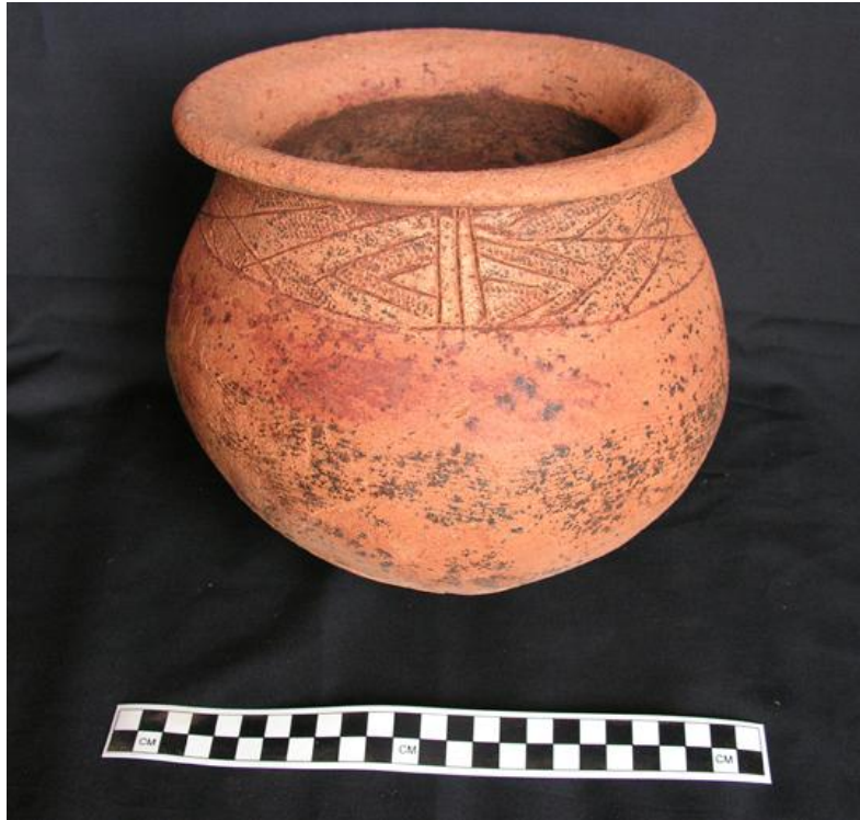
Figure 9. Decorated cooking vessel.

expand and support these findings by refining local ceramic chronologies and broadening excavations at small-scale sites in the Savi hinterland. Though through such research, the lives of those Huedans residing outside of palaces are coming into tighter focus. With this emerging clarity, we are broadening the historic narrative to include an under-explored group that was intimately and at times forcibly drawn into the Atlantic world.