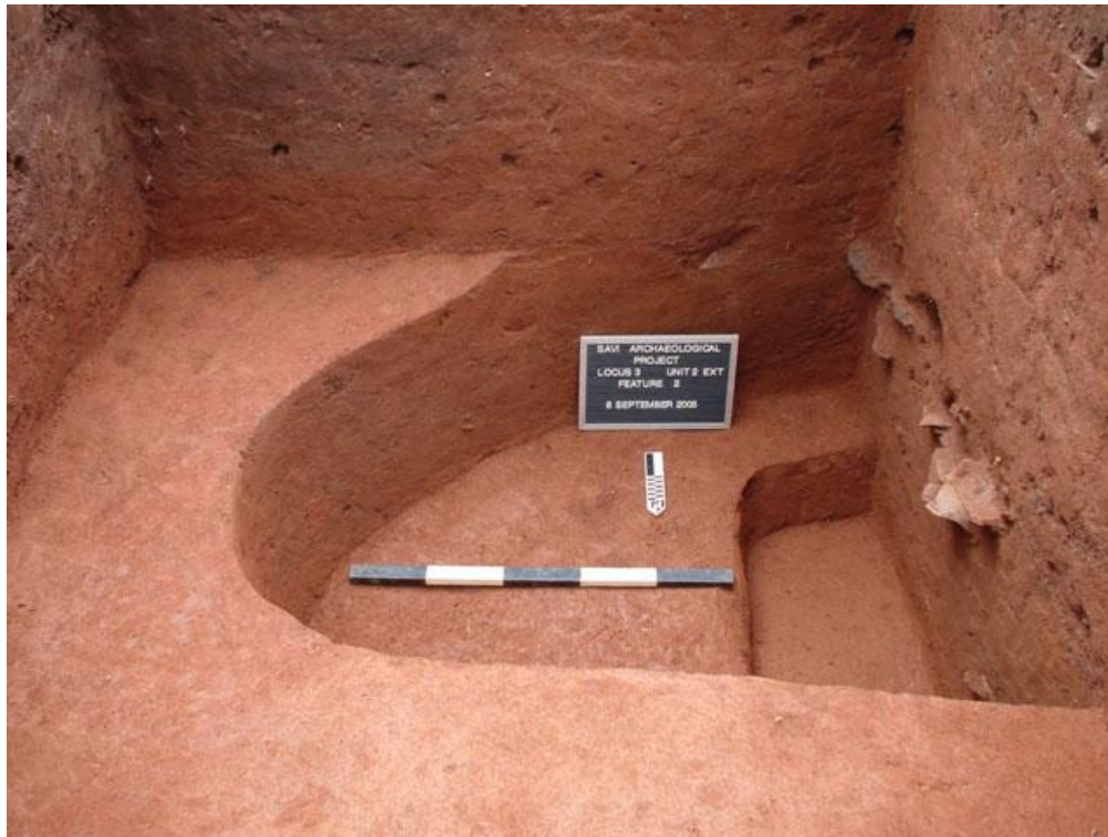
Figure 2. Sample excavation unit.