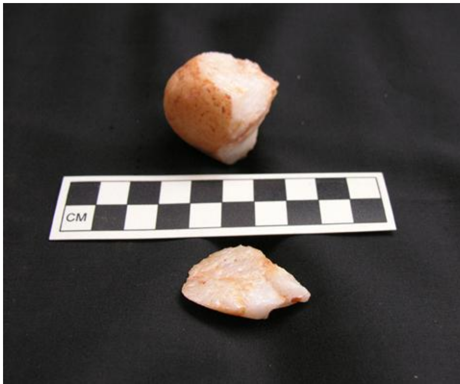
Figure 3. Quartz core and reduction flake.

suggests a shifting settlement pattern in the early Atlantic era away from aquatic resources and towards international trade. When comparing the two assemblages, there is a vast increase in the diversity and frequency of material between LSA assemblages and those for Savi-era material. Among locally produced ceramics, the ware types and vessel forms recorded in the Savi countryside are remarkably similar to those recorded by Kelly (1995: 139-57) within the palace. Likewise, distinctive local coarse earthenware ceramic decoration such as rouletting, stamping, incising, perforating, and composites of these four recovered in the palace were also recorded in the countryside sites (Figure 4).