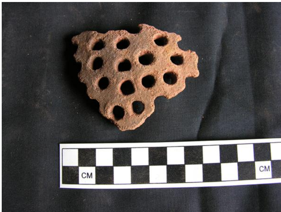
Figure 4. Perforated ceramic sherd.