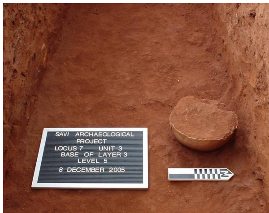
Figure 7. Jar containing fragmentary skull.

recovered in large clay vessels suggest war trophies collected during military expeditions were placed in religious contexts near residential structures (Figure 7). 8 Excavations within, or nearby,