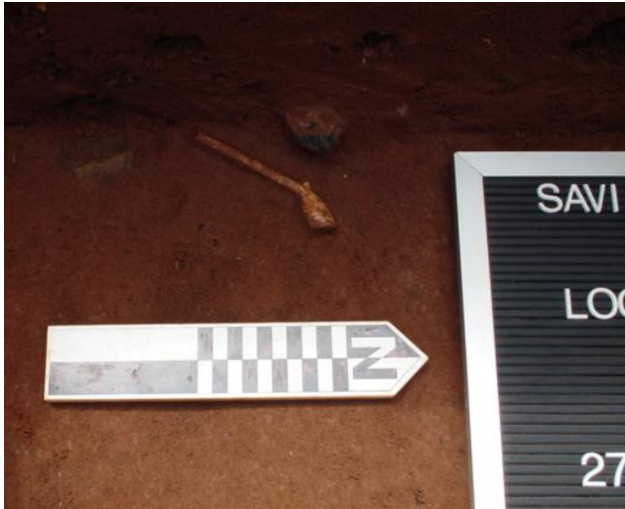
Figure 5. Dutch trade pipe recovered on an 18 th century living surface.

trade, sale, or gifting. Access to European-manufactured trade items was not equal, however: Dutch trade pipes, Italian beads, hollow ware and glass items were dramatically less densely concentrated in countryside sites than those contexts recorded by Kelly in the palace (Figure 5).