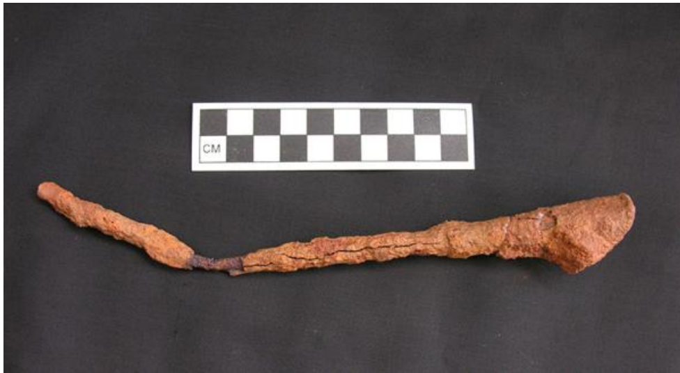
Figure 6. Spear fragment.

social practices during the early 18th century. The excavated remains of a short locally produced metal spear head reflect martial practices (Figure 6). Likewise, at three loci, disarticulated skulls