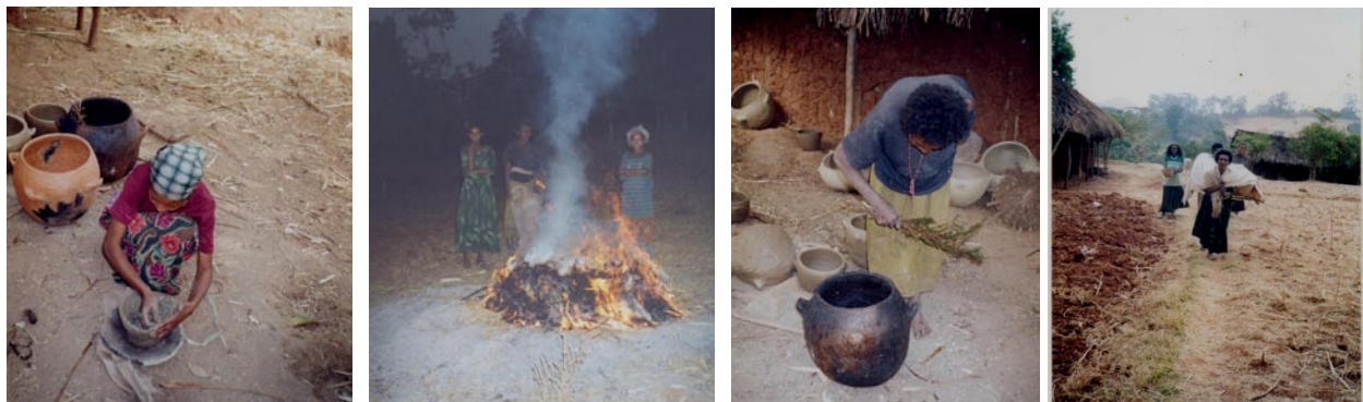
Figure 2. From left to right: a young potter shaping a vessel; artisans firing pots using straws and stalks; a vessel under post-firing treatment ( sileessuu ); and potters transporting clay vessels to market.

Handicraft works, which are owned and run by artisans, include the activities of pottery making, iron smiths, jewelry production, weaving, woodcarving, tannery and basketry. In