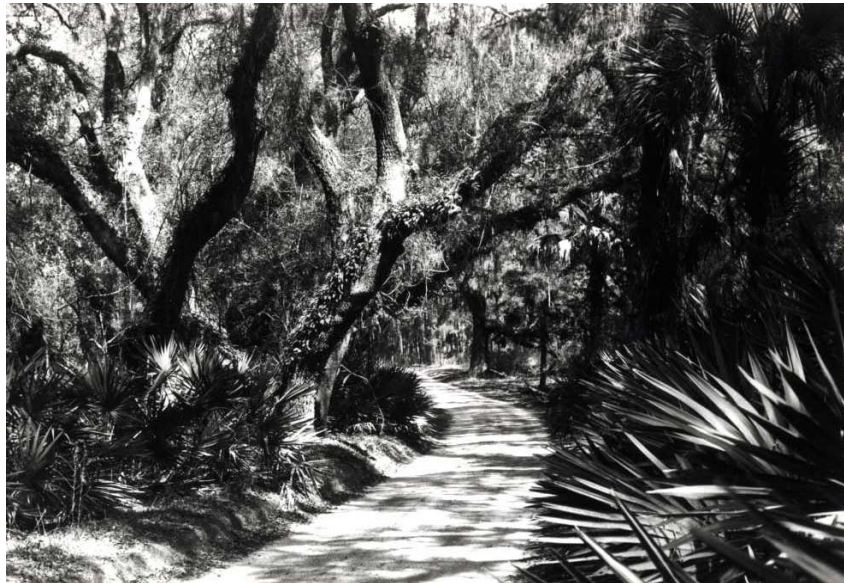
Figure 1. A main road on Cumberland Island (1950).

A long chain of barrier islands shields the coast of Georgia from the Atlantic Ocean. Toward its southern end at Jekyll Island the chain curves inwards. Two miles south of Jekyll lies Cumberland Island, the last of the Georgia sea islands, whose southernmost sand dunes and marshes mark the Georgia-Florida border. Amelia Island, the next southern sea-island, is in Florida. A narrow channel, called St. Marys Inlet, separates Cumberland from Amelia.