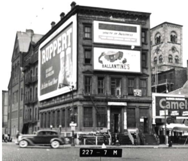
Figure 5. Peoples Bank, at “Bank Corner,” where Canal Street and Lower Broadway intersect, New York City (1943).