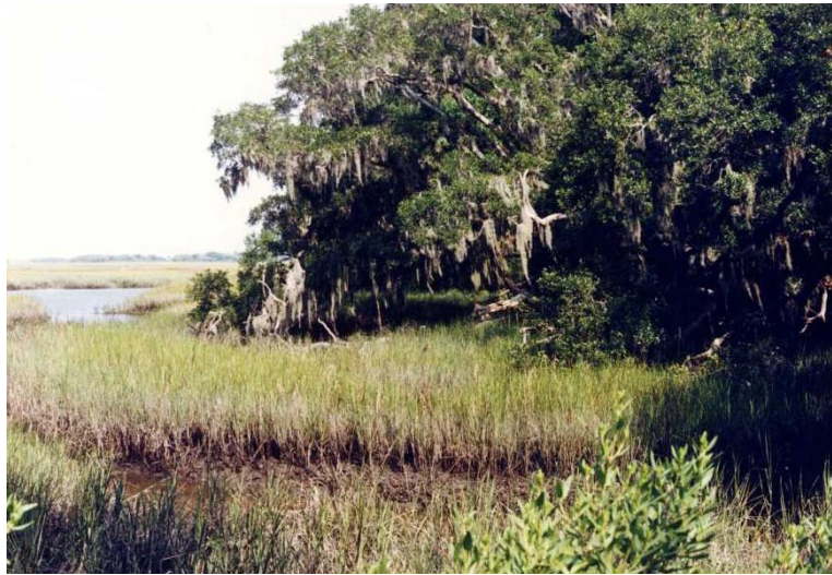
Figure 2. Cumberland Island shore line (1960).

ownership of the Camden Packet which got them the job. 3 The boy was named after his father and his uncle.