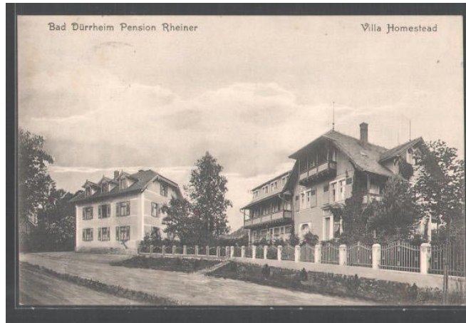
Figure 8. Postcard, Pension Rheiner and Villa Homestead, circa 1943, Bad Duerrheim, Germany.