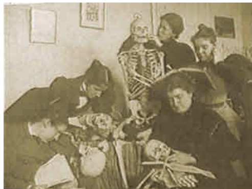
Figure 4. Medical students at play.

Part of the Hospital's administrative problem was jurisdictional. Both Interior and Army administered the Freedman's Hospital. Howard University, although physically close to the hospital, was built upon a nearby hill. Little overlap existed between the personnel of the two institutions, and there was constant friction between them. Two particular issues stood out. One was over water consumption. Water was carried to the University by pumping it up hill. There were constant complaints from the patients about getting enough water to the hospital wards and kitchens. The second difficulty was over the disposition of the dead. The patients entertained the darkest suspicions regarding the hospital's "Dead House" (the morgue). The senators noted with distaste frequent mention of an un-named female medical student whom the patients considered overly active in her search for body parts.