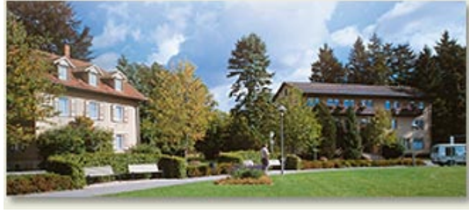
Figure 7. Kursanatorium Karolushaus, Bad Dürrhein. The two buildings above became the clinic known as Karolushaus. Pension Rheiner is at left; Villa Homestead is at right.