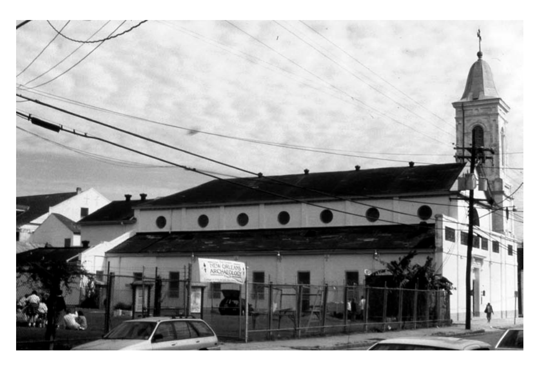
St. Augustine Church during the "Archaeology in Tremé" public program