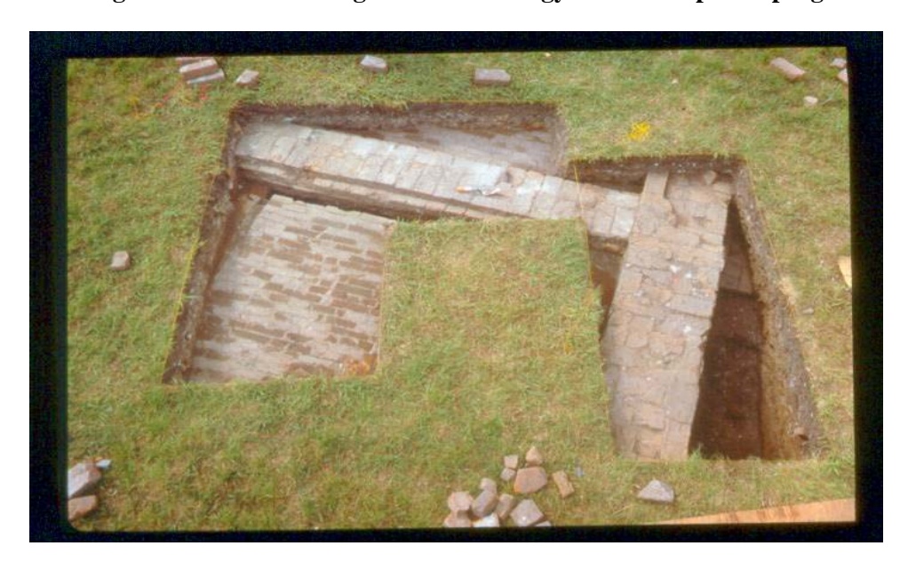
Overview of the Tremé Plantation house foundation and brick floor unearthed during the "Archaeology in Tremé" excavation

Return to December 2011 Newsletter: http://www.diaspora.uiuc.edu/news1211/news1211.html