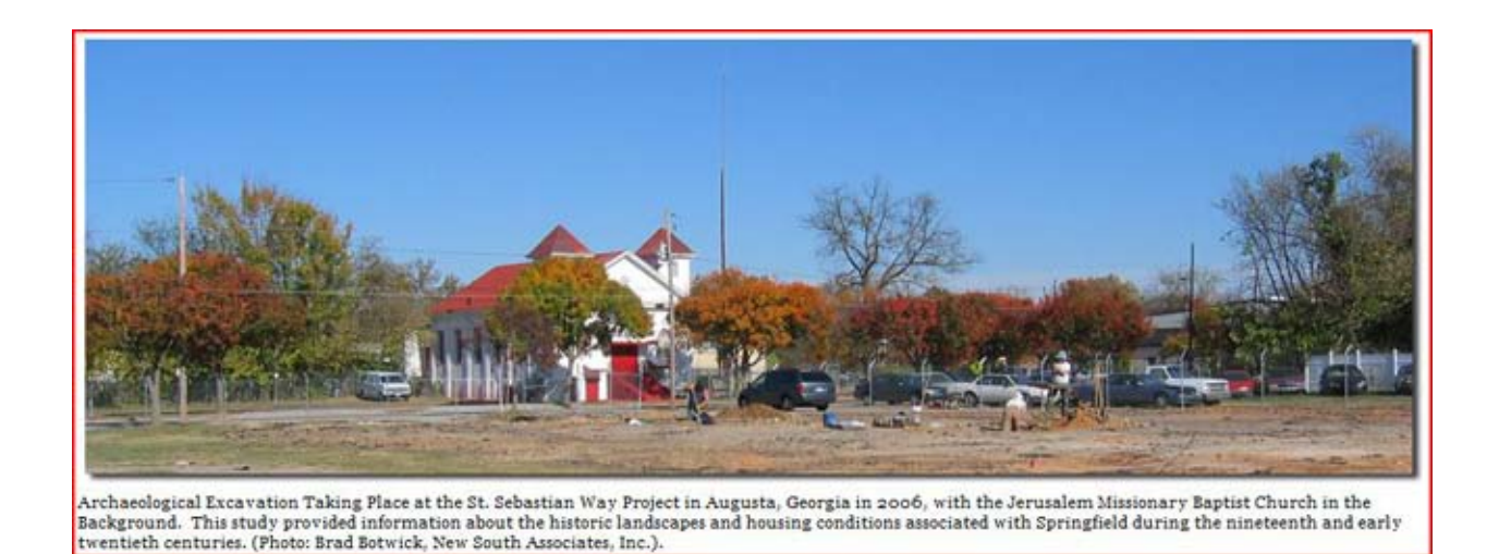
Click on the illustrations to visit www.africanamericanspringfield.org

identified an antebellum-era occupation consisting of a post-in-ground structure and surrounding pit features containing domestic refuse. The location of this structure, on the riverbank and crossing lot lines, as well as its architecture, suggest it was a squatter residence. As Augusta