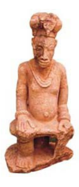
Figure 3. Examples of steatite statues uncovered in landscape surrounding Esie.

However, in addition to the remarkable cultural heritage represented by those figurines uncovered at Esie and other sites, features of the natural and cultural heritage of the homeland region of the Igbomina people also include: