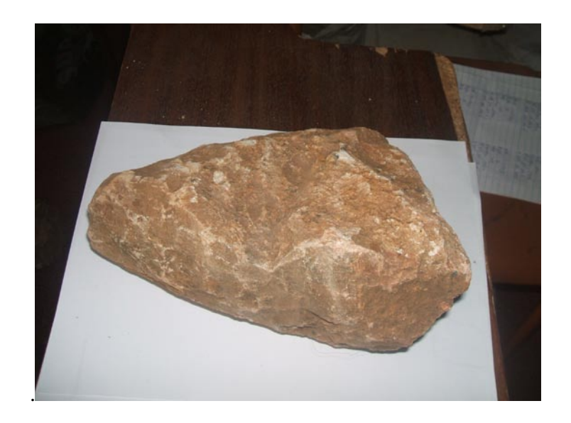
Figure 5. Prehistoric worked lithic artifact uncovered in 2008 survey.

reported to the team that the implements of Opon ayo , a game common among the Yoruba people, were often made of steatite and used by current occupants of the area. Apart from the stone sculptures, five refuse mounds were identified; two of these had been excavated by a previous archaeologist, Onabajo. The whole landscape was littered with pottery sherds of diverse sizes and decorations. Pieces of terra cotta were also collected in the survey.