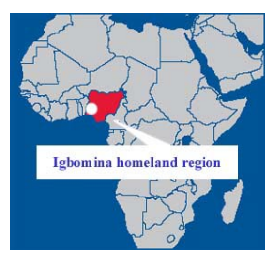
Figure 1. Study area location within modern Kwara State, Nigeria.