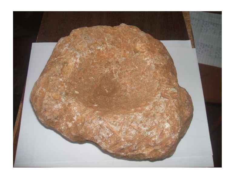
Figure 4. Example of grindstones uncovered in 2008 survey.

Okodo, several centers of past human activities were observed. At Igbo ilowe, reconnaissance in an area covering about 2.5 square kilometers yielded the remains of additional steatite sculptures. Among the other more prominent archaeological finds in this survey are: a fishing weight; a prehistoric-period worked stone implement, which would have been perceived in historic period cultures as a "thunderbolt" ( edun ara ); and several grinding stones, some of which were made of