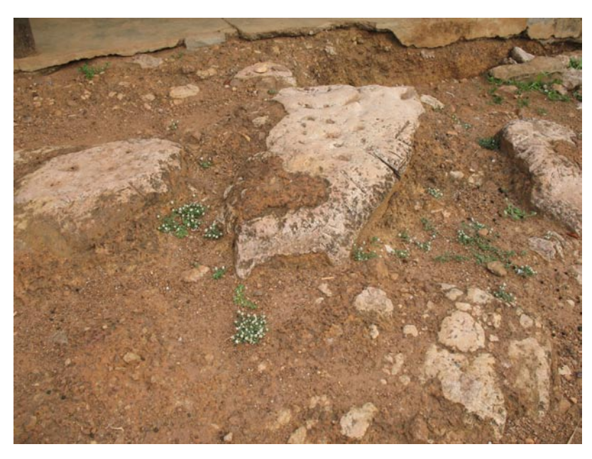
Figure 6. Outcroppings of steatite in ground surface of 2008 survey area.

reported to the team that the implements of Opon ayo , a game common among the Yoruba people, were often made of steatite and used by current occupants of the area. Apart from the stone sculptures, five refuse mounds were identified; two of these had been excavated by a previous archaeologist, Onabajo. The whole landscape was littered with pottery sherds of diverse sizes and decorations. Pieces of terra cotta were also collected in the survey.