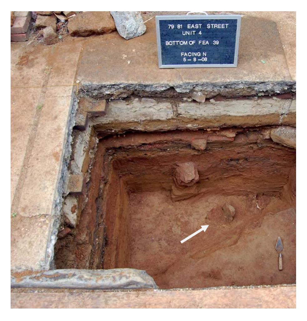
Figure 3. Excavation unit in which the bundle was uncovered. The top of the axe head is visible and still in place.