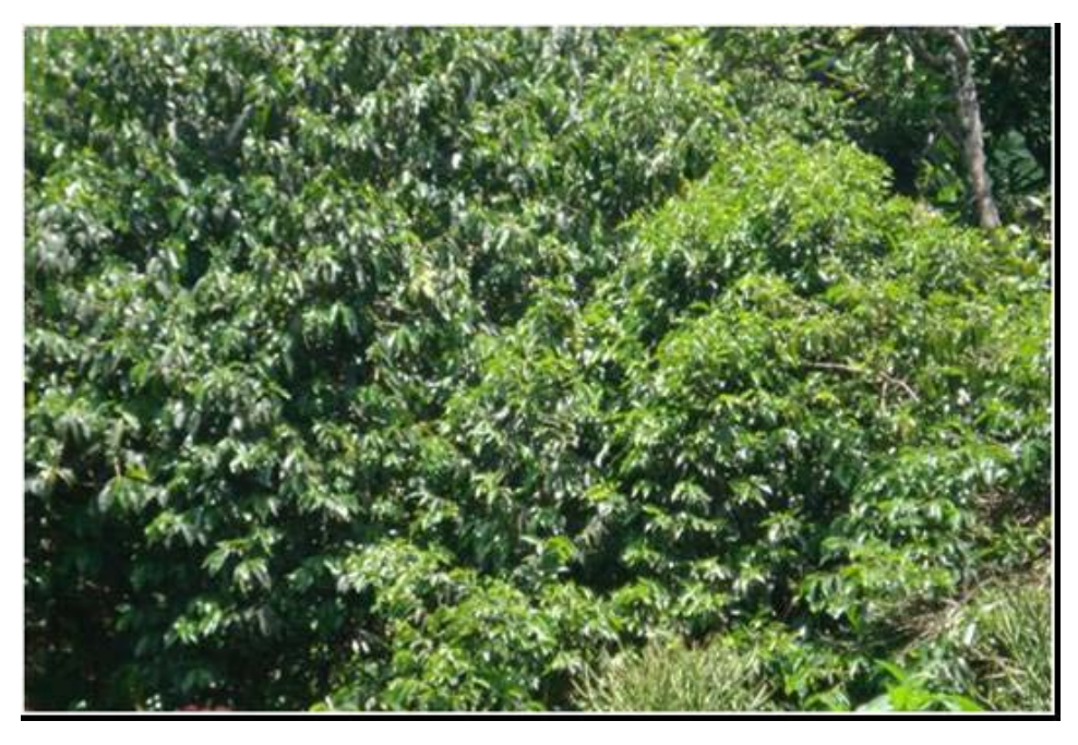
Figure 2. Peasant owned coffee plantation.

The Oromo who traditionally personalize the earth always wish it to be covered with plants. They equate land without plant cover with a naked person. In their tradition, land void of vegetation results in cracks which is metaphorically become mouths by which it speaks to Waaqa the fact that the people are violating safuu (norms) and feedha Waaqaa (will of God). Furthermore, the cracks are considered as cracking baby's body due to lack of clothing and butter (traditional body oil). Planting trees including coffee plantation is believed to be clothing the earth and appearing Waaqa .