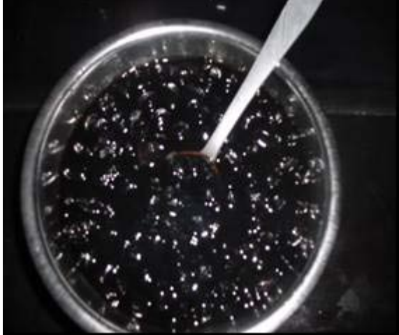
Figure 4. A. Buna qalaa being prepared