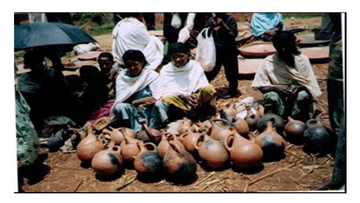
Figure 6. Potters selling Jabanaa at market place, Guyyi, West Wallaga.

The other useful pottery vessel in the coffee ritual is jabanaa (Figure 5). In rural areas coffee beans are toasted for making coffee. Normally, it is toasted on a small sized griddle known as beddee bunaa . The roasted coffee is then put in a wooden bowl (pistil) known as mooyyee bunaa for the grinding and thereafter it is ground by small mortar, muka mooyyee bunaa . Eventually the powdered coffee is added to boiled water in a clay pot as ( jabanaa ), which is over fire on hearthstones. When the jabanaa is still over fire, an appropriate amount of salt is added. The use of jabanaa for making coffee has continued in both rural and urban areas. As stated above, one of the reasons for the continuity is that jabanaa has no equivalent substitute.