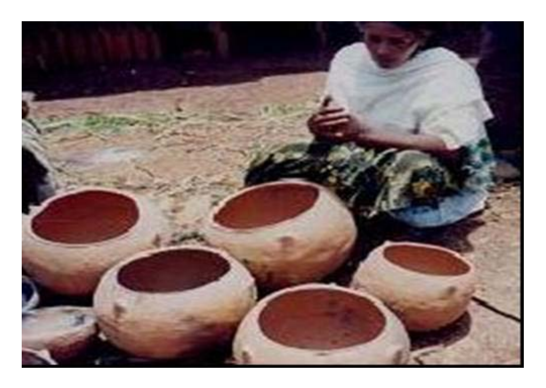
Figure 5. A potter at market for selling waciitii.

sacrifice. In this occasion, the coffee ceremony provides the community with a moment of unity and brings members back to their tradition, their own roots and their own identity. The coffee ceremony is also referred to as a school of socialization because it is during this occasion that the youths are told proverbs, stories, as well as thoughts, customs, and norms of the community. Furthermore, as the coffee ceremony is dominated by women it is an avenue for them to come together, discuss and handle social issues, and share ideas.