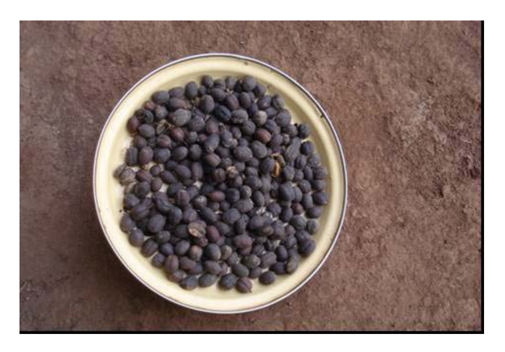
Figure 3. Dry coffee berries.