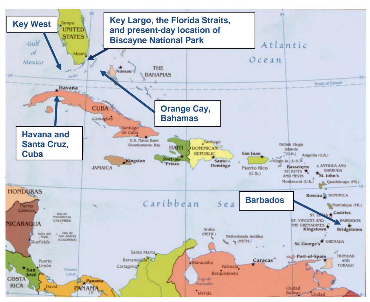
Figure 2. Map showing Caribbean locations related to the last voyage of the Guerrero and movement of other related vessels (image by C. Fennell).

Two days later at Orange Cay, the Bahamas, a more real object came into view: the laden Guerrero . The brig was sailing from the north down the Florida Straits, attempting to evade the British patrolling the long north coast of Cuba. The Guerrero had only 250 more miles to sail before reaching Havana (Fig. 2). It was noon. From the Nimble 's log: