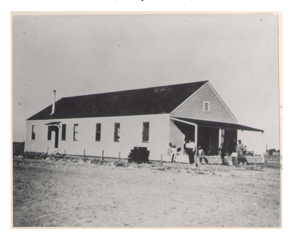
Figure 2: Allensworth Hotel circa 1911.

establish the Allensworth Polytechnic Institute was defeated in 1915 by State legislators and the Los Angeles African American electorate. There was hope that if this bill passed it would secure the return of the needed economic base (Ramsey 1977:59-67).