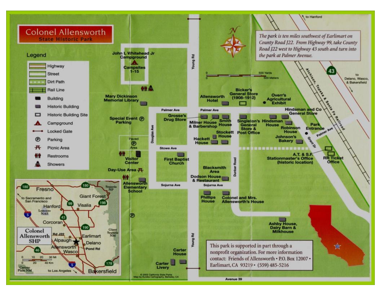
Figure 1: Allensworth brochure vicinity map (DPR 2003).

Movement and to honor the legacy of its slain leader (Ramsey 1977:189). In 1971, the State Park and Recreation Commission concluded, "the California State Park System is deficient in historical preservation and interpretative programs giving recognition to the role played by Black citizens in the development of California" (DPR 1971:x, 1976:5). The Environmental Impact Statement (EIS), in the same report, acknowledged the development of the Park as a positive and significant shift for the state in answer to "nonharmonious attitudes in our social environment,"