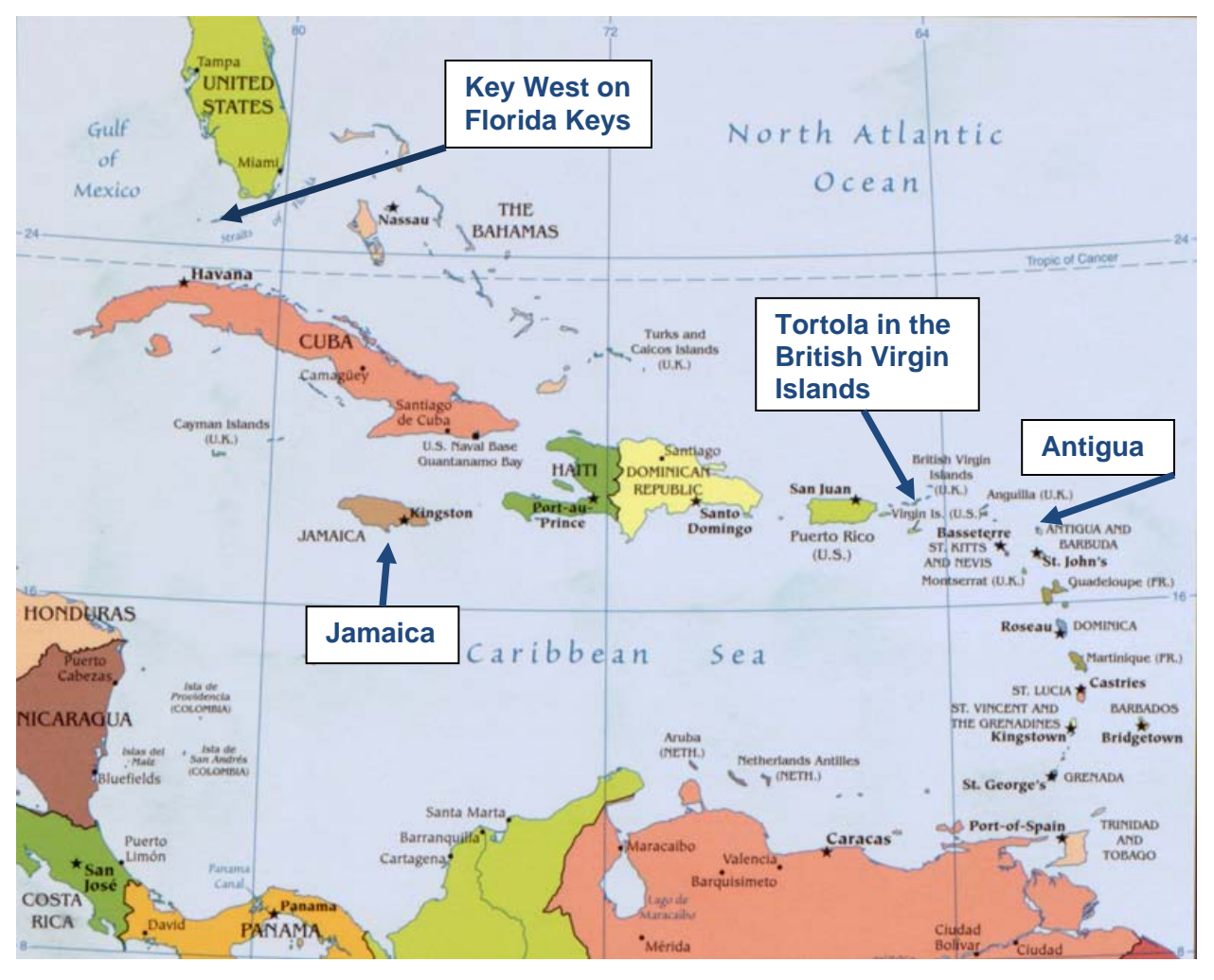
Figure 1. Map showing Caribbean locations related to voyages of the Fly (image by C. Fennell).

human "cargo" of 68 captive Africans at Sierra Leone and delivered them into slavery at Antigua in the Caribbean (Figs. 1, 2). Only 53 captives survived the voyage. The Fly returned to Bristol June 2, 1787, and Clarkson observed and examined the ship there in that same month. He does not refer to this ship by name, and there are confusing aspects to his documentary records, because he had examined another slave ship several months earlier, a much larger one, also named the Fly , commanded by Capt. Colley. That vessel was U.S. built and was anchored at another location along the Thames River.