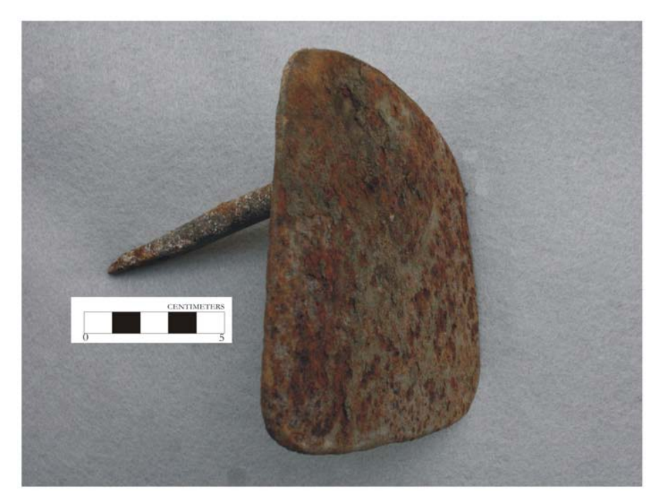
Figure 5. The hoe blade.

At least one other example of folk ritual using a hoe blade is recorded. In Calvert County, Maryland, a hoe blade was discovered in the bottom of a pit feature located directly outside the main doorway to the Indian Rest cabin, occupied from the 1870s through 1934 by at least two black families. Based upon its location and contents, the pit was interpreted as a conjure deposit, with the iron of the hoe blade acting in a protective capacity. The Terminus Post Quem (TPQ) for the feature was 1903, indicating that folk ritual practices using iron hoe blades continued at least into the early twentieth century (Derr 2007: 51). A large iron implement (an axe) has also been interpreted as serving a protective ritual function in a dairy at the Thomas Williams site in Delaware, placed there between 1887 and the 1920s by the free black Stump family (de Cunzo 2004). It is not clear whether the hoe or axe configuration of those tools had any significant meaning in ritual context, or whether their importance lay solely in their iron content or in the fact that they were edged tools.