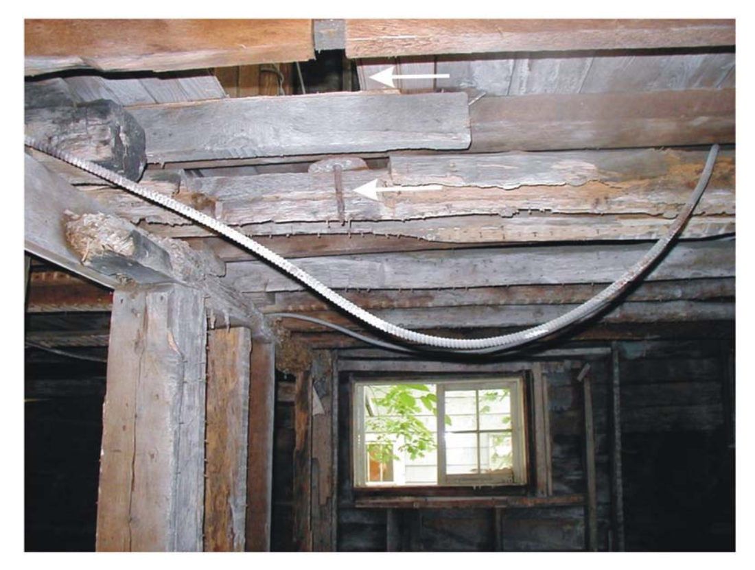
Figure 4. Hoe blade in situ. The upper arrow points to the hole in the second floor for the no longer extant chimney; the lower arrow points to the hoe blade, June 12, 2009.

The iron hoe blade was found resting on a hand-hewn second floor joist between the first floor ceiling and the second story floor, immediately south of the former hole for the chimney stack and beneath a saw-cut timber (sees Figures 3 and 4). The hand-hewn floor joist had been notched to accommodate the former chimney stack; the hoe blade was located within the notch. The location, hidden between the first and second floors and directly associated with a chimney, strongly suggests that this is an example of a folk ritual concealment. Characteristics of the hoe are consistent with a late nineteenth through early twentieth century manufacturing date (see Figure 5). Based solely on the manufacturing date of the hoe blade, it could have been associated with either the Mann family or later, twentieth century occupants of the house. Following Fennell's lead (2000), the hoe blade is evaluated according to both black and European folk ritual traditions.