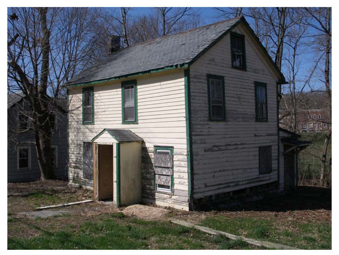
Figure 2. Photograph of house exterior, April 14, 2009 9.

The Mann family homestead at 37 Mill Street was a frame building with a dry-laid stone foundation. It was built circa 1857 of large timbers cut in the late eighteenth century, and reused from some earlier building, likely a barn or other large post and beam structure. The house never contained a fireplace; instead, an iron stove located near the center of the house provided heat for cooking and to warm the house. The presence of large amounts of coal, coal ash, coal slag, and coal cinder throughout the archaeological assemblage, including the earliest contexts, indicates that this stove burned coal instead of wood. The chimney stack for the stove, likely built of brick, extended up through the second floor and into the attic, exiting near the center of the house.