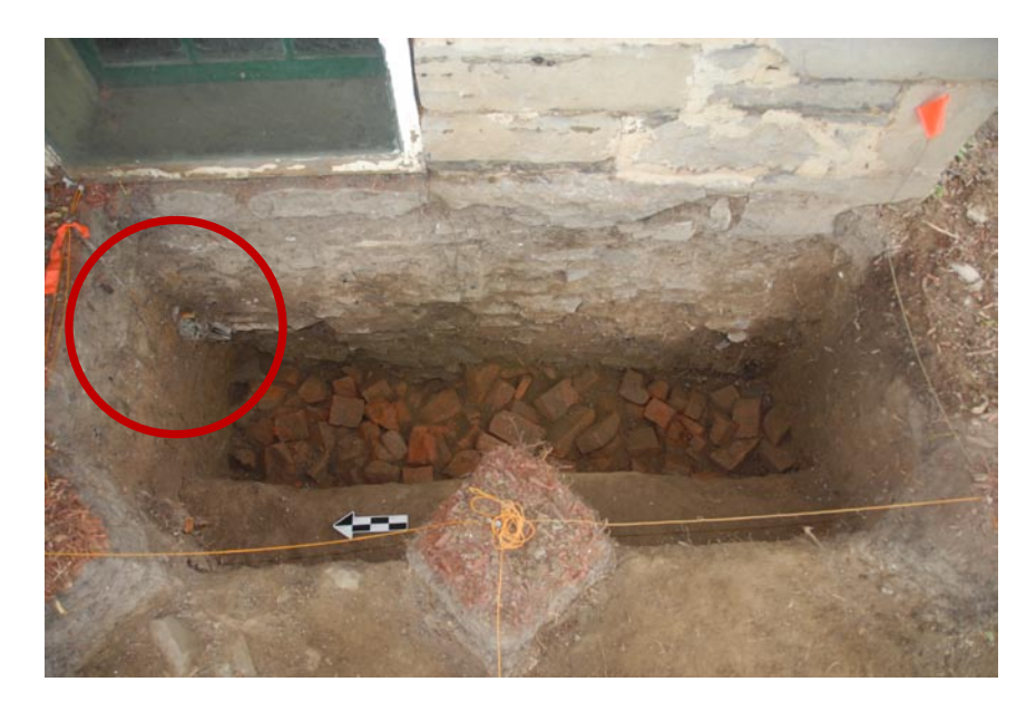
Figure 6. A builder's trench with brick at the base contains a cache of medicinal items, including fourteen pharmaceutical bottles and a tooth brush (highlighted by the red circle); the bristles on the tooth brush were apparently burned in the fire.

brick kiln (Figure 7). This type of brick kiln was constructed of raw brick and was dismantled after the bricks were fired. The fired brick were then sold for use in regional house construction. This type of brick clamp is the probable source of brick used in the construction of Tubman's house. The African American community, including Nelson Davis, was deeply involved in the local brick making industry and it is probable that Davis, as well as other relatives and friends, were involved in all phases of the design, production of materials, and construction of her brick house. The brick clamp at the Harriet Tubman Home for the Aged is currently being analyzed as part of Alan Armstrong's honors thesis at Syracuse University.