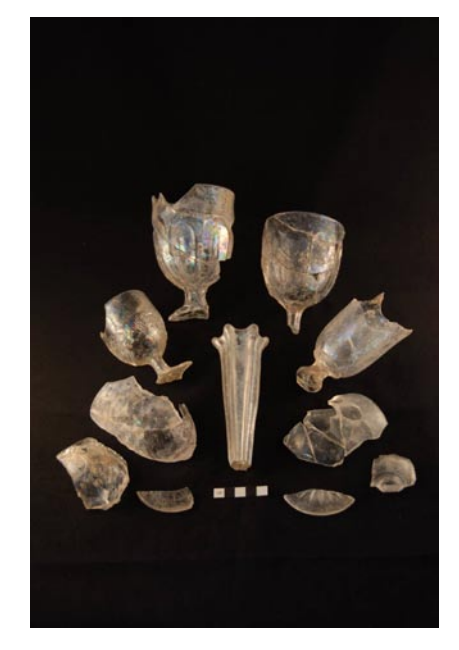
Figure 5. Stemware burned in house fire (February 10, 1880) and deposited in builder's trench near Harriet Tubman's front door of brick house constructed on the same site in between 1880 and 1882.