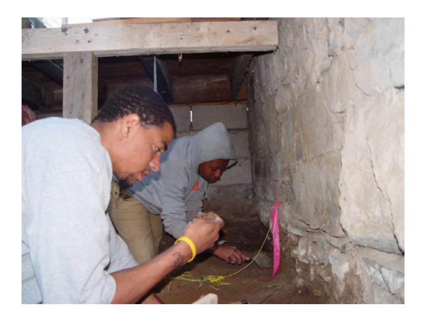
Figure 4. Syracuse University students excavating under porch at Harriet Tubman's brick house.

Based on the surveys and the sequencing of plans for restoration of sites on the property by the Harriet Tubman Home, Inc., it was decided that Harriet Tubman's brick house, on her original seven acre farmstead, would be the focus of our archaeological explorations beginning in 2002. Almost immediately after beginning excavations just outside the foundations of the standing brick house, we found evidence of a house fire and over the next several years continued to excavate discrete features that revealed not only the fact that Tubman's original wood frame structure burned in 1880, but that she and her family rebuilt on the same foundation (Figures 4-6). They first dug a builder's trench, then re-pointed the old field stone (shale) foundation and added a cut limestone foundation (Onondaga limestone) upon which they built a brick house. Most of the personal and household possessions of Tubman and those who resided