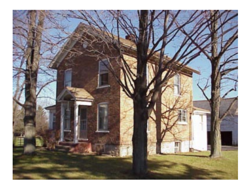
Figure 1. Harriet Tubman's brick farm house on seven acre farmstead, Fleming, New York.