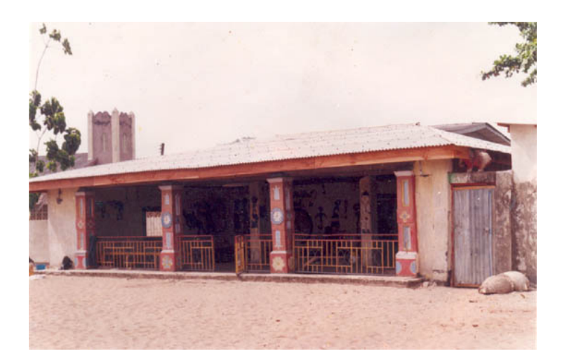
The Vlekete shrine and venue of Badagry slave market.

Baracoons played important roles in the gruesome treatment that were meted out to slaves in the area during the trans-Atlantic slave trade era. Baracoons served as makeshift houses in which many captives were imprisoned while others were taken into the slave market at the site of the Vlekete shrine within Badagry. By the time captives were sorted into groups within that marketplace, a slave ship would have arrived at the nearby Gberefu beach. Enslaved persons were then transferred to the ship for the horrific voyage of the Middle Passage across the Atlantic Ocean and on to the plantation fields of the Americas.