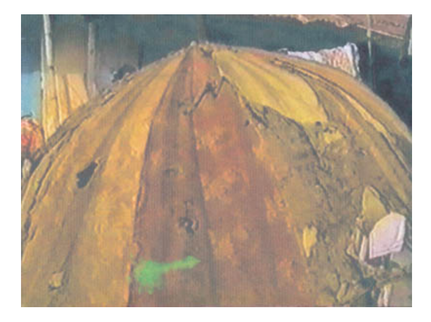
Seventeenth-century Portuguese umbrella given as a gift to a local slave dealer, Chief Seriki Abass. Photo taken in 2001.