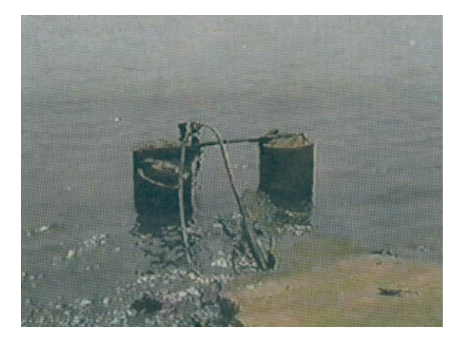
Captives were transported through the "gate of no return" in Gberefu village to the awaiting ship on the Atlantic Ocean. Remnant posts of the structure are shown above.