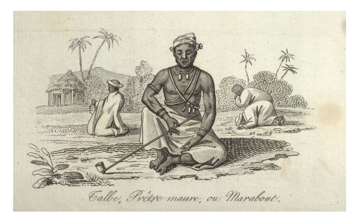
Figure 2. A Senegalese Marabout holding the long stem of an elbow pipe, 1780s. For details, see <u>www.slaveryimages.org</u>, image reference "VILE-factitle".

Although Africans produced their own pipes, white clay pipes of European manufacture, particularly English and Dutch, were commonly used to purchase slaves. The market for these products, as with beads and other commodities used in the slave trade, fluctuated from region to region and period to period, but in general it appears that European pipes were often preferred to African ones; and African consumers even made distinctions among different European pipes.