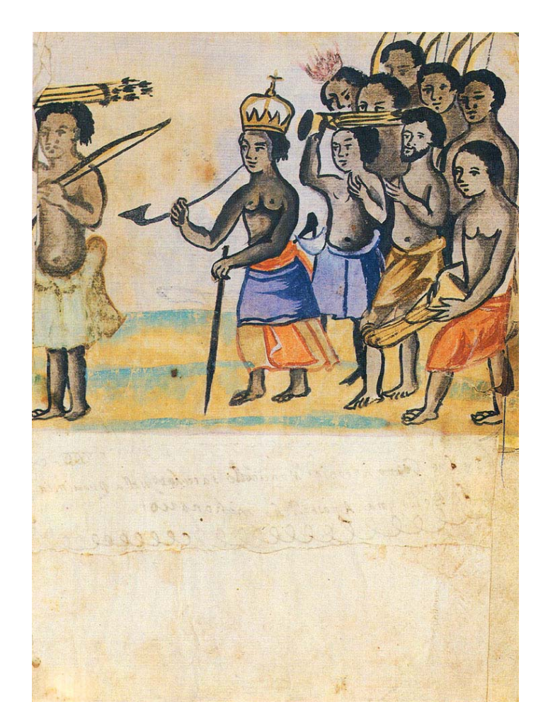
Figure 1. Queen Nzinga, Kingdom of Kongo, smoking a longstemmed elbow pipe, 1670s. For details, see <u>www.slaveryimages.org</u>, image reference "Bassani-27".

African consumers chewed tobacco, used it as snuff, and also smoked it in pipes they themselves produced. These were frequently short-stemmed clay bowls of one kind or another, so-called "elbow bend" or "elbow" pipes, into which a detachable hollow wood tube or reed stem, sometimes of considerable length, was inserted. A wide range of "elbow bend" pipes, dating from the early seventeenth-century, have been discovered in a variety of West African archaeological sites from the Middle Niger to the coastal areas of Benin and Ghana<sup>3</sup> (Figs. 1, 2, 3).