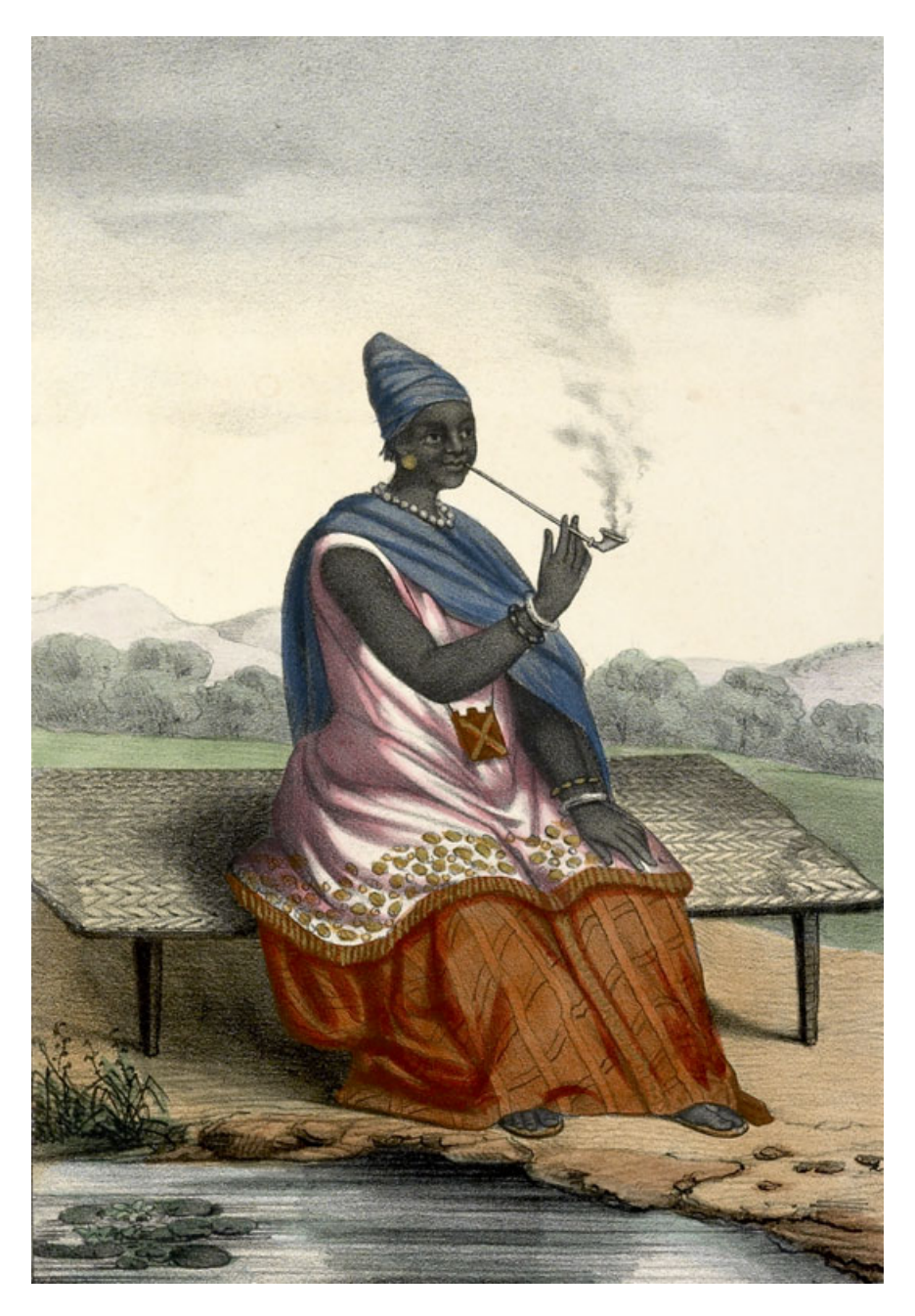
Figure 3. Wolof Queen Ndeté-Yalla, smoking a long-stemmed elbow pipe, Senegal, 1850s. For details, see <u>www.slaveryimages.org</u>, image reference "Boilat03".

included 30 dozen "long tobacco pipes" and 90 dozen "slave pipes," the former of greater monetary value than the latter, and Jean Barbot, the agent for the French Royal African