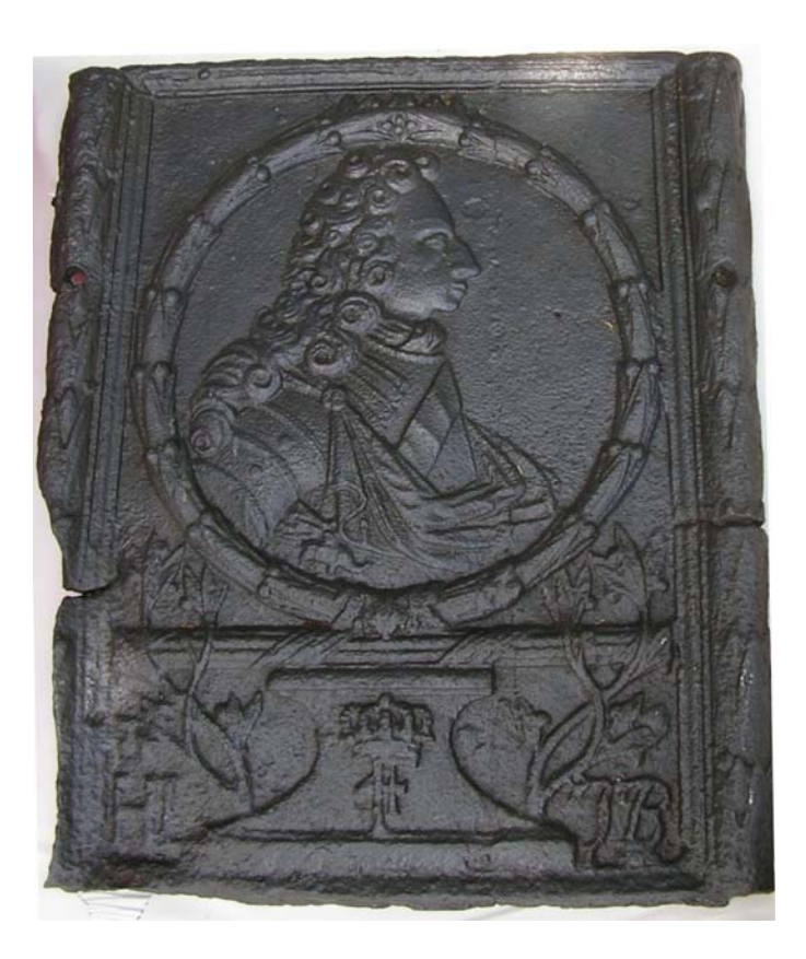
Figure 2. Cast Iron Fireback. Profile is King Frederick IV of Denmark.

Residents have provided some hints of the material record of this region. In 1971, a fireback, heavy and quite unexpected for the locale (Figure 2), was found near the point where the Braden River enters the Manatee. In 2007, a neighbor to the Manatee Mineral Spring, while digging their garden, recovered a Harper's Ferry Model 1816 bayonet. To the north, in the Little Manatee River, a drum was pulled out of the river's muck (see photograph in Landers 1999:232).