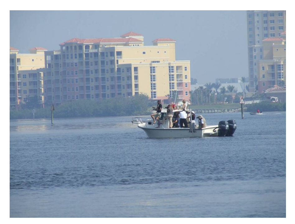
Figure 4. Underwater survey of the Manatee River.

Initial testing in some likely locales produced challenges (Baram, 2006) that required that the methodology be rethought (see Norton and Espenshade 2007). We moved to surveys, both underwater in the river and with remote sensing on land. The underwater survey (Figure 4) showed a clear river bottom, the result of a series of efficient Army Corps dredging.<sup>1</sup> One area, a mile west of the Braden River, may be promising; scuba searches are being planned for that locale.