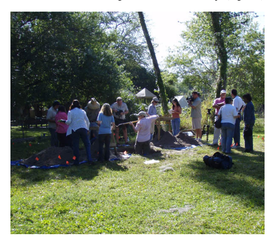
Figure 3. Media interest in the excavations.

From the start, Looking for Angola has had a firm commitment to civic engagement and public education. Dozens of public lectures and discussions from Tampa to Sarasota mark the endeavor as well as extensive media coverage and teachers' workshops (Figure 3). A web page