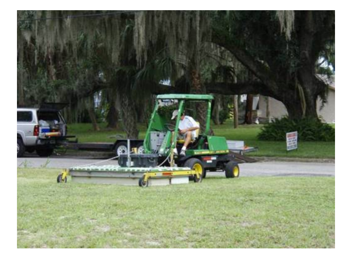
Figure 5. Radar tomography survey.

On land, the area around a mineral spring – a source of fresh water – offered possibilities. Witten Technologies provided hi-resolution 3D underground imagery: the radar tomography (Figure 5) involved a mobile array of rapid-fire GPR antennas, precise laser-tracking and sophisticated image processing software. In the scanning phase, a commercial tractor propelled the array across the ground at about two miles per hour, while the seventeen antennas inside fired in a controlled but rapid sequence and a laser surveyor's instrument tracked the array's position. The result provides possible architectural features over the three acres around the spring as well as many other possible archaeological features.<sup>2</sup>