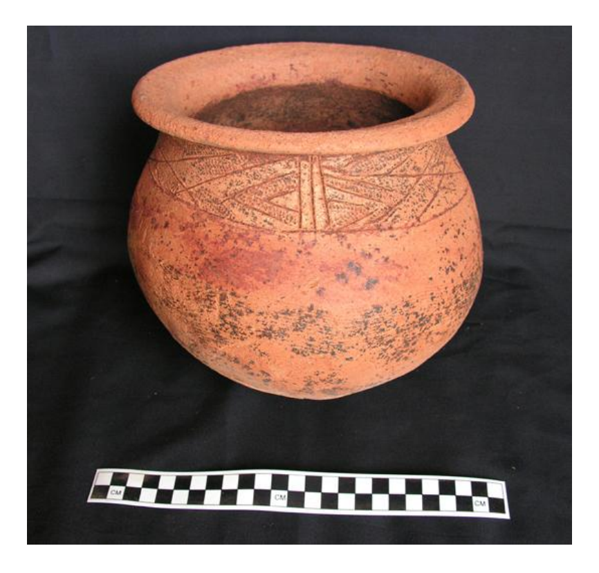
Figure 9. Decorated cooking vessel.

expand and support these findings by refining local ceramic chronologies and broadening excavations at small-scale sites in the Savi hinterland. Though through such research, the lives of those Huedans residing outside of palaces are coming into tighter focus. With this emerging clarity, we are broadening the historic narrative to include an under-explored group that was intimately and at times forcibly drawn into the Atlantic world.