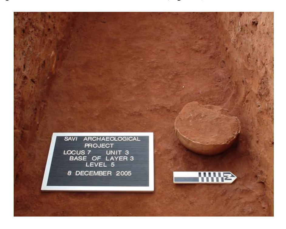
Figure 7. Jar containing fragmentary skull.

recovered in large clay vessels suggest war trophies collected during military expeditions were placed in religious contexts near residential structures (Figure 7).<sup>8</sup> Excavations within, or nearby,