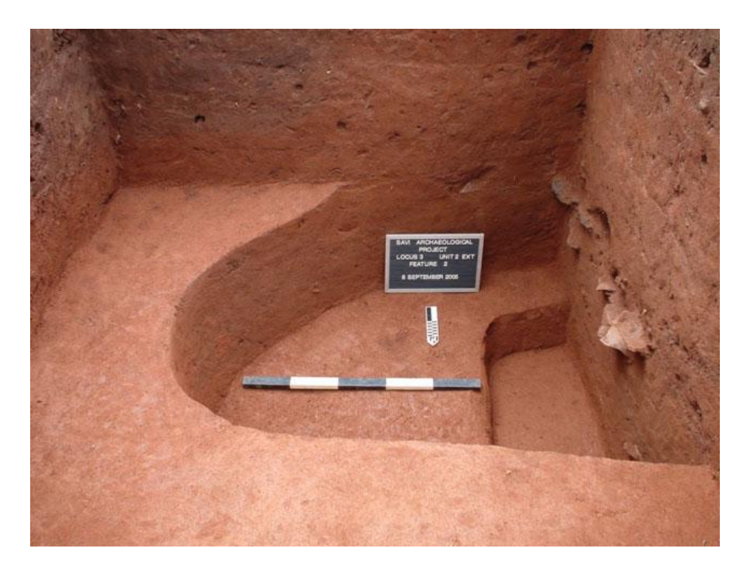
Figure 2. Sample excavation unit.