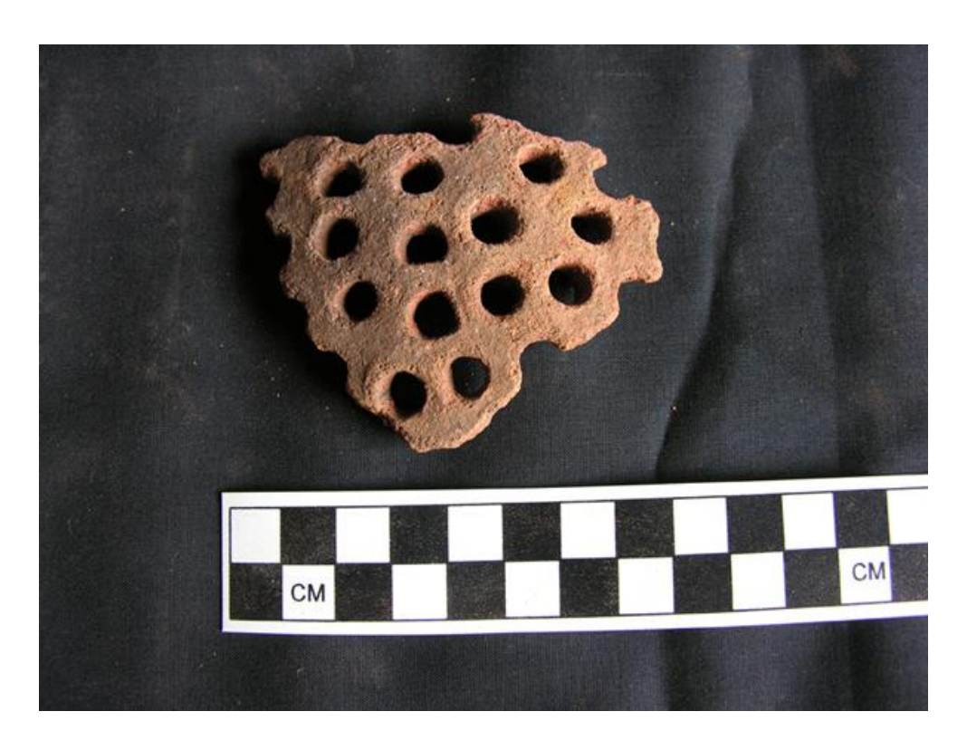
Figure 4. Perforated ceramic sherd.