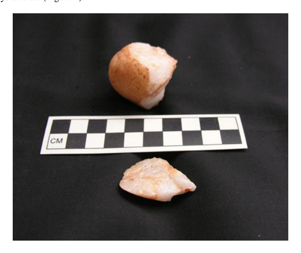
Figure 3. Quartz core and reduction flake.

suggests a shifting settlement pattern in the early Atlantic era away from aquatic resources and towards international trade. When comparing the two assemblages, there is a vast increase in the diversity and frequency of material between LSA assemblages and those for Savi-era material. Among locally produced ceramics, the ware types and vessel forms recorded in the Savi countryside are remarkably similar to those recorded by Kelly (1995: 139-57) within the palace. Likewise, distinctive local coarse earthenware ceramic decoration such as rouletting, stamping, incising, perforating, and composites of these four recovered in the palace were also recorded in the countryside sites (Figure 4).