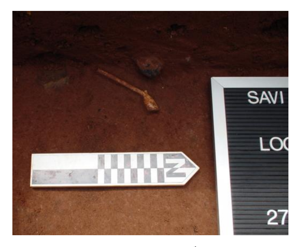
Figure 5. Dutch trade pipe recovered on an 18<sup>th</sup> century living surface.

trade, sale, or gifting. Access to European-manufactured trade items was not equal, however: Dutch trade pipes, Italian beads, hollow ware and glass items were dramatically less densely concentrated in countryside sites than those contexts recorded by Kelly in the palace (Figure 5).