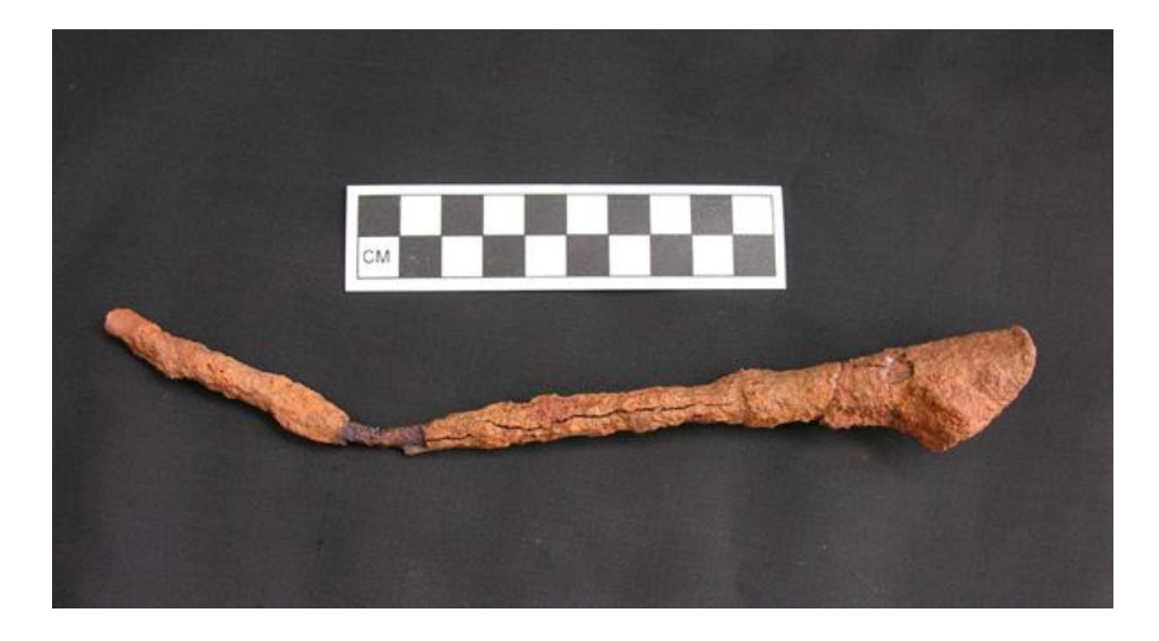
Figure 6. Spear fragment.

social practices during the early 18th century. The excavated remains of a short locally produced metal spear head reflect martial practices (Figure 6). Likewise, at three loci, disarticulated skulls