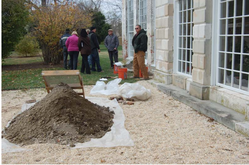
Team at work at the greenhouse (view an enlarged version of this photo ).

Return to March 2011 Newsletter: http://www.diaspora.uiuc.edu/news0311/news0311.html