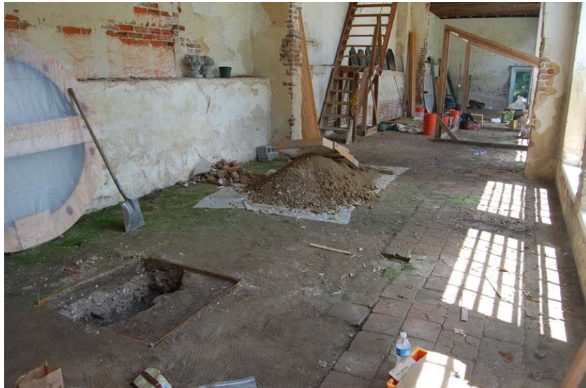
Greenhouse interior under excavation (view an enlarged version of this photo).