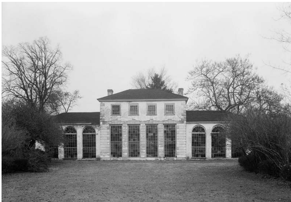
Part of the Library of Congress Collection of the Orangery. Because of its age and uniqueness, the Orangery has been frequently photographed, but, until now, never systematically examined by archaeologists (view an enlarged version of this photo ).