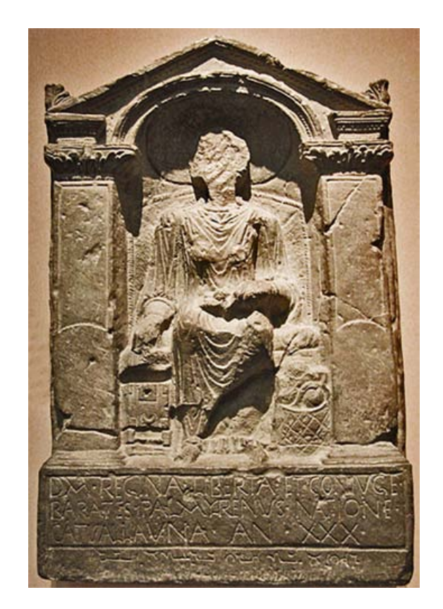
Figure 2. Tombstone of Regina, Great North Museum, Newcastle-upon-Tyne (RIB 1065).

One of the best-known Roman funerary monuments in Britain comes from Arbeia (South Shields), the easternmost fort on Hadrian's Wall (Fig. 2). This monument was commissioned by Barates of Palmyra in memory of his wife, Regina. The Syrian-born Barates is of course a fine example of the voluntary Roman migrant: but what of Regina?