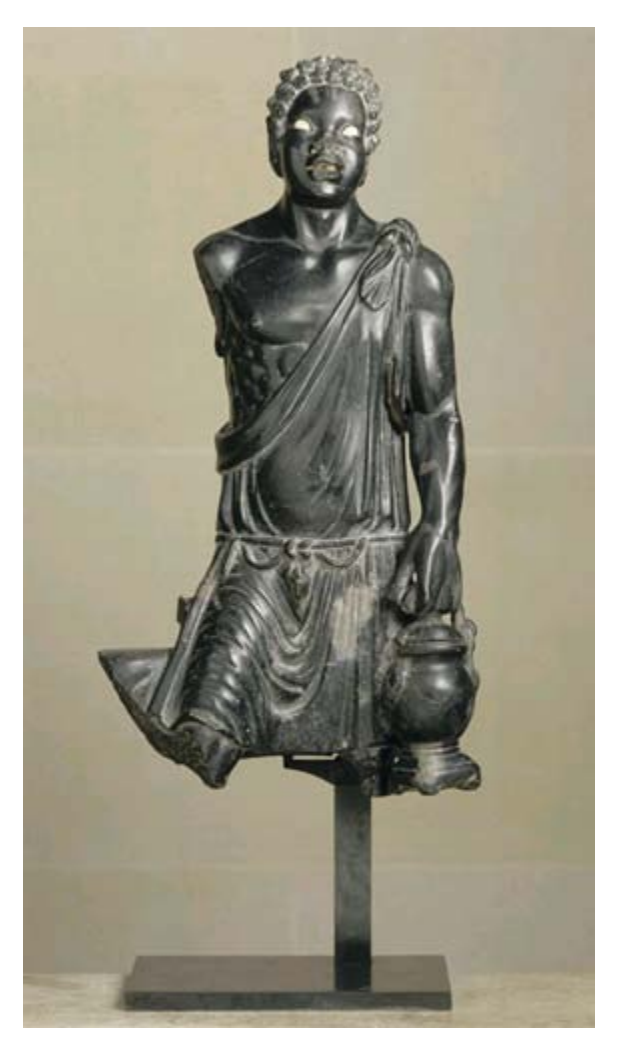
Figure. 1. Black marble statuette from the baths at Aphrodisias, Turkey (late second-early third century CE). The standing figure wears an exomis , a short tunic gathered at the waist and fastened over one shoulder. In his left hand he holds a balsamarium , a flask holding perfumed oil. It is likely, but not certain, that the person depicted was enslaved (Musée du Louvre).

In the Americas, somatic distance rendered slaves (and all persons of African descent) readily identifiable. In the Roman world, by contrast, there was no close correlation between somatic type and servile status. As Thompson (2003: 104) puts it, 'the overwhelming majority of slaves in Roman society was always white.' Difference could be marked on the body in many ways, however, and a small but significant group of texts and artefacts suggest that cicatrisation (scarification) was employed by African peoples known to Rome. For example, cicatrisation marks are clearly present on the terracotta head of a Sudanese woman from the Fayum (Snowden 1970: 22-3 and Fig. 3), but not all blacks in the Roman world were slaves, and there can be no