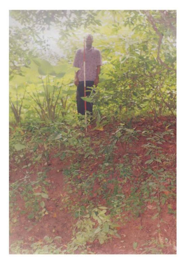
Figure 2. The outer rampart (image by authors).

An iron-working site was located very close to the outer rampart in the northern part of the village. Iron slag and tuyeres litter this area. However, no furnaces were discovered. Oral information showed that iron-working was a major occupation of extinct Keesi . We were also informed that in the process of farming, the people unearthed ' oju awa ' (tuyeres), ' omo owu ' (hammer stone), smoking pipes, and wooden and iron objects, among others. It is disappointing that no records of these finds during farming have been kept and this amounts to a destruction of the archaeological record.