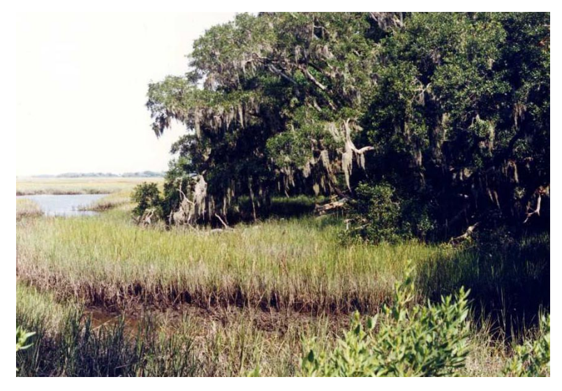
Figure 2. Cumberland Island shore line (1960).

ownership of the Camden Packet which got them the job.<sup>3</sup> The boy was named after his father and his uncle.