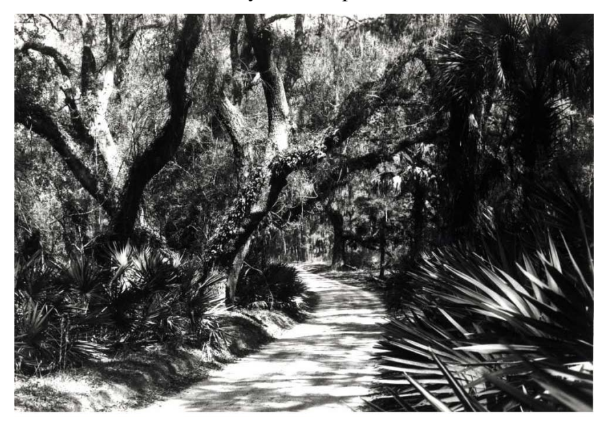
Figure 1. A main road on Cumberland Island (1950).

A long chain of barrier islands shields the coast of Georgia from the Atlantic Ocean. Toward its southern end at Jekyll Island the chain curves inwards. Two miles south of Jekyll lies Cumberland Island, the last of the Georgia sea islands, whose southernmost sand dunes and marshes mark the Georgia-Florida border. Amelia Island, the next southern sea-island, is in Florida. A narrow channel, called St. Marys Inlet, separates Cumberland from Amelia.