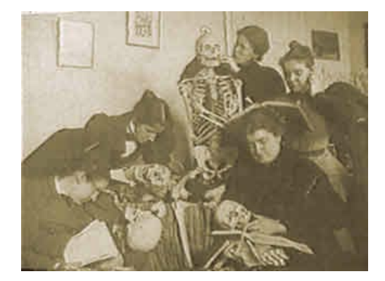
Figure 4. Medical students at play.

Part of the Hospital's administrative problem was jurisdictional. Both Interior and Army administered the Freedman's Hospital. Howard University, although physically close to the hospital, was built upon a nearby hill. Little overlap existed between the personnel of the two institutions, and there was constant friction between them. Two particular issues stood out. One was over water consumption. Water was carried to the University by pumping it up hill. There were constant complaints from the patients about getting enough water to the hospital wards and kitchens. The second difficulty was over the disposition of the dead. The patients entertained the darkest suspicions regarding the hospital's "Dead House" (the morgue). The senators noted with distaste frequent mention of an un-named female medical student whom the patients considered overly active in her search for body parts.