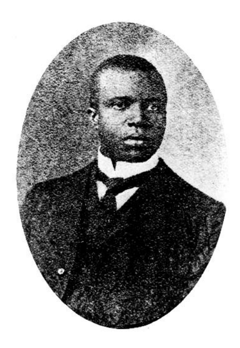
Figure 1: Early 20th Century Photo of Scott Joplin

In 1984, Missouri State Parks acquired the last standing house or structure associated with Scott Joplin, known as the "King of Ragtime," in St. Louis and created the Scott Joplin House State Historic Site (Figures 1 & 2). Efforts by Jeff-Vander-Lou, Inc., a local African-American neighborhood organization, had previously saved this home from destruction and had it recognized as a National Historic Landmark site in 1976. At the turn of the century, Joplin