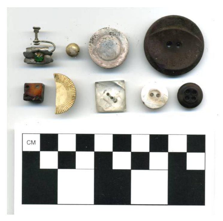
Figure 6: Buttons, Jewelry, Dice, and a Poker Chip from the 2006 Excavation Season

Artifacts that could be directly associated with the 1890s to 1910s female boardinghouses were few. Written documentation does not support or disprove the theory that some or all of these female boardinghouses were houses of prostitution. Previous archaeological studies of bordellos have documented artifact patterns with higher frequencies of lamp glass, personal items (e.g., clothing fasteners, cosmetics, jewelry, grooming items), and a higher socioeconomic pattern in foodways and ceramics than the surrounding neighborhood (Seifert 1991, 2005; Cheek and Seifert 1994). Examples of lamp glass and personal items were collected from this site, but not in the quantity found from previous bordello studies (Figure 6). Similarly, analysis of the ceramics and foodways do not indicate higher status levels.