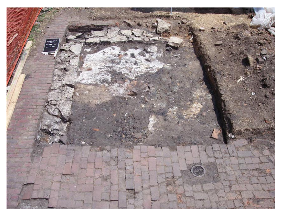
Figure 5: Excavation Block No. 1 with Alley Shed and Brick Pad Exposed

receive indoor plumbing until the 1940s-50s, so it is unlikely that these row houses had in-home toilets with running water. The outhouses may have been frame shacks with no foundation over dirt pits. If so, then the impermanent construction may have been ignored on the fire insurance maps. There is also a possibility that the privies were located in the basement of these row houses, but excavations did not attempt to explore this hypothesis because the basements were