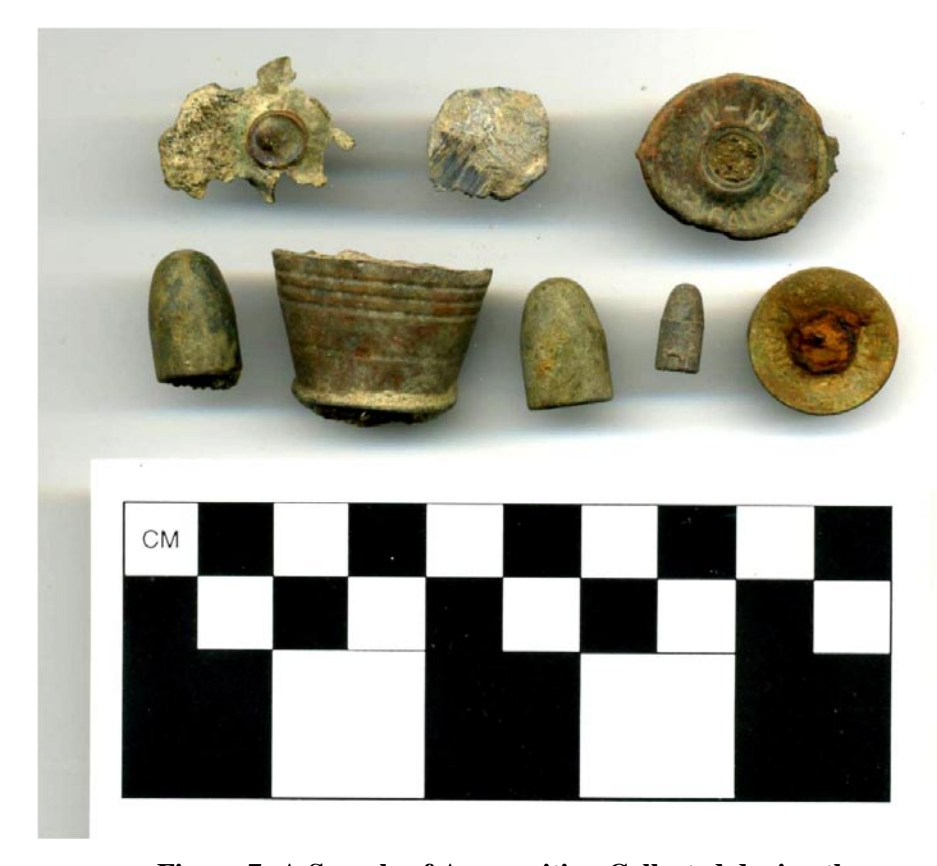
Figure 7: A Sample of Ammunition Collected during the 2006 Excavation Season

concentration of ammunition from one house lot or alley shed, but instead gun activity was found equally across the entire site. What caused this pattern? Oral traditions from this time period