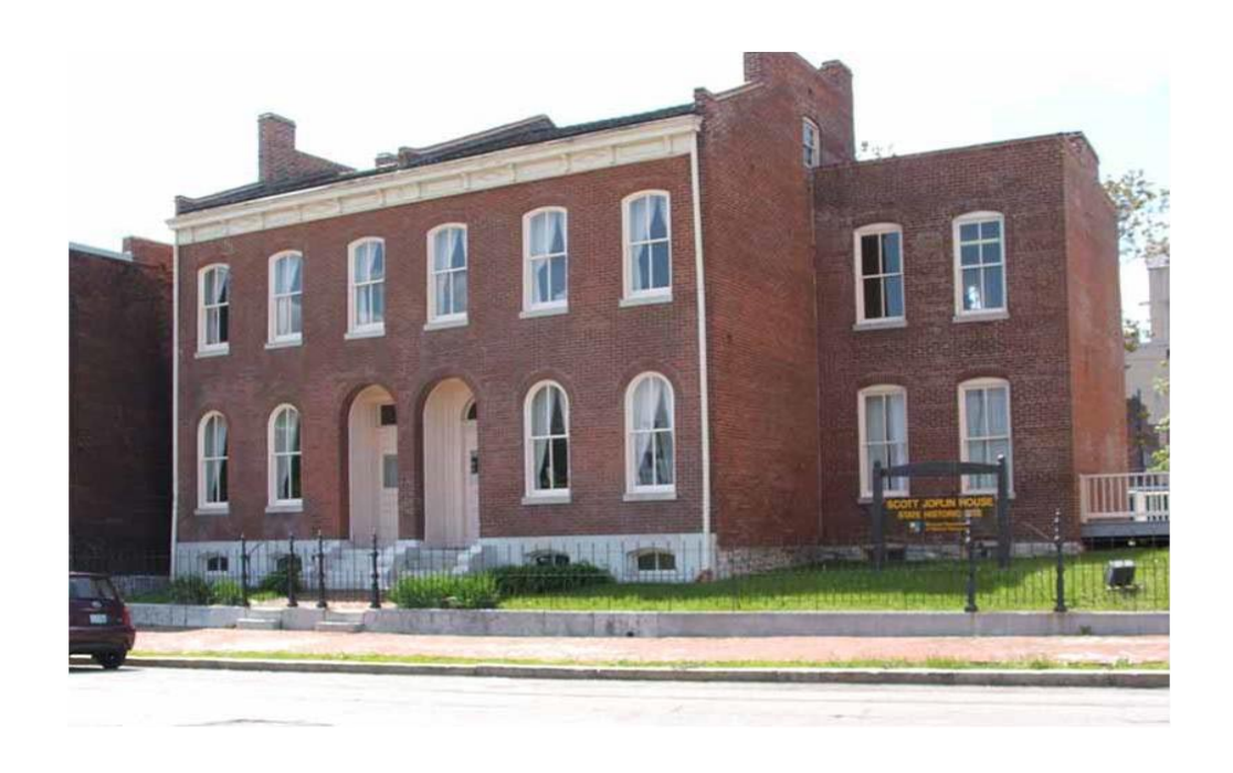
Figure 2: Current view of the Scott Joplin House State Historic Site in St. Louis

By this time, Joplin was already a well-known composer with his earlier publication of the Maple Leaf rag in 1899, which eventually sold over 500,000 copies (Berlin 1994; Curtis 1994). In St. Louis, Joplin focused on composing new rags and teaching, spending little time performing. One of his published works that was written in this house was The Entertainer , which was popularized again by the 1973 Paul Newman and Robert Redford movie, The Sting .