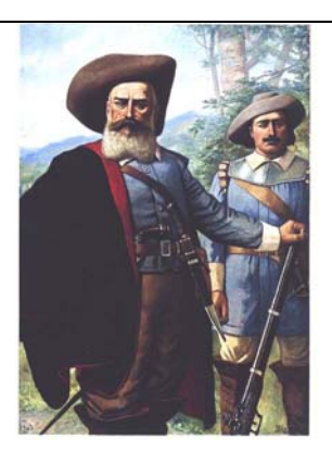
Image of the bandeirante Domingos Jorge Velho, oil painting by Benedito Calixto, 19th century (left), used to exalt the figure of the Paulista Bandeirante, especially that of the man responsible for the military overtaking of the Palmares Quilombo.

governor of Pernambuco decided to summon Domings Jorge Velho, a bandeirante , in 1687, to command the expeditions against Palmares. After seven years of attempts, Domingos Jorge Velho, leading an army of colonists, Indians and mamelucos (mestizos of Indian and European descent), finally destroyed the settlement. Zumbi was not captured until November 21, 1695.